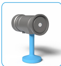
\frac{1}{8} " Clamp ASME BPE/BS 4825