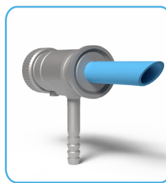
With deep tube \varnothing 10 \times 1\text{mm} L.45mm