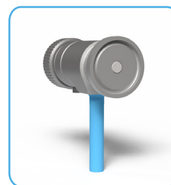
Butt Weld \varnothing 6.35 \times 1.24\text{mm}