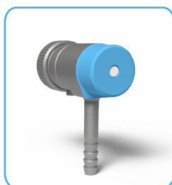
Butt Weld \varnothing 19.05\text{mm}