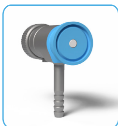
\frac{1}{2} " - \frac{3}{4} " Clamp ASME BPE /BS 4825