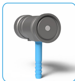
Hose barb \varnothing 6.35 \times 1.24\text{mm}